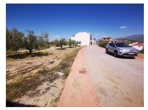
EXCLUSIVE: 3 x Urban building plots located at the very top of the village of Vinuela with all mains services and roads in place ready to present a project to the town hall. Rare opportunity with very good views, rustic land at the rear of each plot and walking distance to all amenities. Vinuela has improved hugely this last 8 years and the village is becoming more and more popular as amenities and infrastructure get better and better. Each plot is just under 150m2 in size but allows up to 300m2 build. Most likely to be town house design to make the most of the large build area or it has been know if a buyer is interested in buying 2 or 3 of the plots then this allows enough land to build a detached property. All roads, street lighting and services are in place and the land is currently classed as URBAN so a project must be declared to the town hall in order to apply for the building licence. A fantastic opportunity for a buyer with their own ideas of a substantial build.