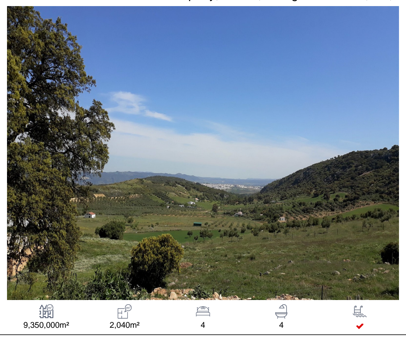
FREEHOLD - An incredible opportunity to purchase approx 950,000 ha of land / 2 semi detached houses with two floors / pool / self contained flat with large barn / old cortijo and barn and a cortijo ruin in an unrivalled location of the beautiful city of Ronda. This stunning location offers a fantastic opportunity to anyone looking for a large piece of land for development. Located just outside Ronda in the heart of rural Andalucia but still within just 50 kilometres of the coast. This dramatic piece of land, due to its size and geography, offers endless opportunities for investors. It is permitted to build 220,000m2 of the estate which is located in the municipality of Ronda. This development permit has come with the designation "Turístico y Social sobre Actuación Urbanística". Luxury villas, a hotel, bungalows, studios, a wellness complex with a sports centre and even a campsite are all part of the alternative possibilities for a tourist complex based on the municipal decision. Architectural plans have already been drawn up for a country hotel and the land has been allocated a "caza mayor" for hunting. This would be a great opportunity, as Ronda is one of the most popular tourist des...