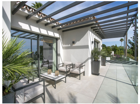
Web: www.jacarandaspain.com Email: info@