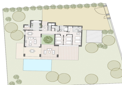
Ejemplo de implantación en parcela B3. Example setup in plot B3